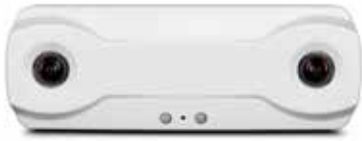
FLIR Brickstream 3D Gen 2 with BLE and WIFI