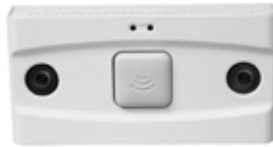
FLIR Brickstream 3D+

www.flir.com/peoplecounting NASDAQ: FLIR